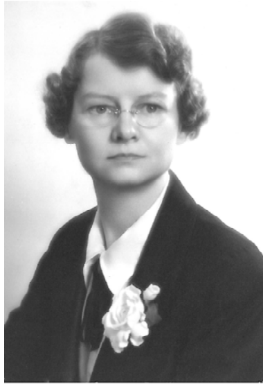
Dr. Nina Fay Calhoun International Relations Award

The Dr. Nina Fay Calhoun International Relations Award was adopted in 2002 as a memorial to the only International President who served two terms and who focused on the International aspect of our organization. The objectives of this International Relations Award are as follows: