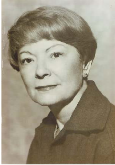
Letha H. Brown Literacy Award